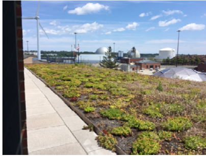
Green Roof on Administration Building

In addition to the procedures and best management practices listed above, the NBC has incorporated measures to limit the quantity of storm water discharging to the Providence River via the storm water system. Green roofs and a rain garden were installed when the Administration Building was constructed. In addition, porous pavement has been used in the facility during repaving operations. These measures allow storm water to be beneficially used and recharge the ground water.