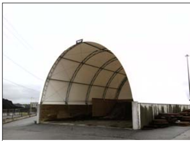
Salt Storage Area

The NBC has a salt pile at Field's Point. The salt pile is covered and not exposed to the weather. Salt is stored appropriately to prevent material from adversely impacting the storm water drainage system.