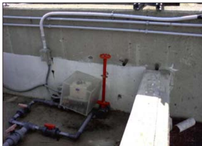
Valve to discharge storm water in secondary containment at the Chlorine Contact Tank

Preventive Maintenance: The NBC has established an extensive preventive maintenance program.