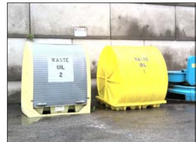
Used Oil Storage Bins

Minimizing Exposure: The NBC stores all chemicals inside buildings where practicable. Where chemicals and used oils are not stored inside of a building, they are stored inside storm resistant enclosures. These measures prevent exposure to rain, snow, snow melt and runoff and the impact on the storm water drainage system. There are some locations at the facility where chemicals are exposed to the weather. These chemicals are stored in weather resistant tanks and containers. The tanks and containers are either in permanent secondary containment or on spill pallets. Although the tanks and containers are exposed to rain and snow, there is no adverse impact on the storm water drainage system. Storm water captured in the secondary containment is inspected prior to being released. If it is determined that the storm water is contaminated it would be pumped out and disposed of properly.