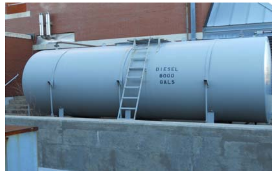
8,000-gallon Diesel Tank for the Ernest St. Pump Station