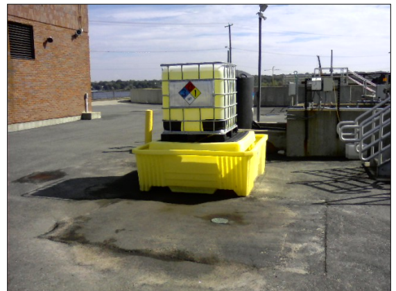
350-gallon tote on spill pallet at the Chlorine Contact Tank