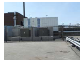
6,800-gallon Diesel Tank

There is 3,500-gallon diesel holding tank located between the COB and the storage building. The diesel stored in this tank fuels a generator used to supply back-up power for the WQSB and COB. This tank is double walled and is housed in a structure for the generator. Any spills associated with this tank would be contained and the material would be collected for future use or shipped offsite for disposal.