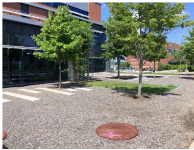
Rain Garden at Administration Building