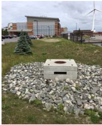
WQSB Storm Water Facility

Water Quality Science Building (WQSB): A storm water facility was installed during the construction of the WQSB. This storm water facility consists of a sediment forebay and an open channel. Storm water flows through this facility to the Providence River via a storm water line on New York Avenue.