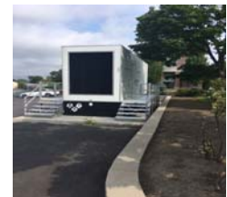
3,500-gallon Diesel Tank

There is 3,500-gallon diesel holding tank located between the COB and the storage building. The diesel stored in this tank fuels a generator used to supply back-up power for the WQSB and COB. This tank is double walled and is housed in a structure for the generator. Any spills associated with this tank would be contained and the material would be collected for future use or shipped offsite for disposal.