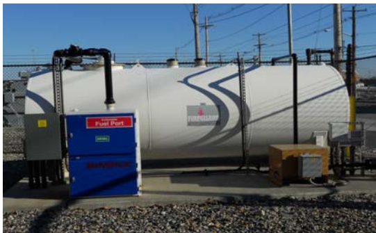
2,500-gallon Diesel Tank for the Tunnel Pump Station

The remaining two diesel tanks are located at the Ernest Street-Tunnel Pump Station site. The largest tank is 8,000-gallons and is located adjacent to the Ernest Street Pump Station. The tank is stored in a secondary containment concrete area that is capable of containing 20,340-gallons. The containment area is equipped with a manually operated valve to discharge accumulated storm water after inspection. The second tank is 2,500-gallons and is located outside of the Tunnel Pump Station building. It is a double-walled tank capable of containing 110% of the volume of the tank.