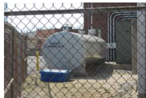
4,000-gallon Diesel Tank