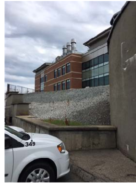
Rip Rap on Embankment behind the WQSB

There are no areas at Ernest Street/Tunnel Pump Station where there is a high potential for soil erosion that could impact the storm water drainage systems.