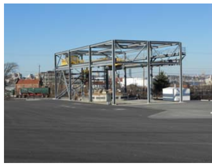
Tunnel Screening Facility – Crane Structure

There are no areas at Ernest Street/Tunnel Pump Station where there is a high potential for soil erosion that could impact the storm water drainage systems.