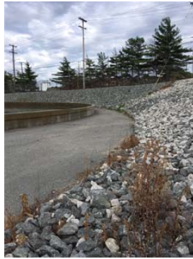
Rip Rap on the South Side of the Plant

At the Field's Point treatment plant there are two areas where erosion could occur. In order to prevent erosion, rip rap has been installed.