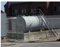
5,100-gallon Diesel Tank

Diesel fuel is stored in six above ground tanks at Field's Point. Three are located at the treatment plant. There is a 5,100-gallon tank that is stored in a bermed area with a containment capacity of 7,248 gallons. Any spills in this area would be contained and pumped out for offsite disposal or future use. The containment berm is equipped with a valve that is normally closed. The valve would only be opened to discharge storm water in the containment area once it has been determined it is not contaminated with diesel. A 4,000-gallon tank containing diesel fuel is located next to the screw lift building. This tank is double walled and is located on a graveled area. Any spills in this area would discharge to the ground. The spilled diesel fuel and contaminated soil/gravel would be collected and shipped offsite for disposal. The third diesel tank at the plant was installed as part of the plant upgrades for the BNR process. The tank holds 6,800-gallons and is double walled. In addition, it is housed in a structure for a generator. The structure provides an additional 9,874 gallons of containment. Any spills associated with this tank would be contained and the material would be collected for future use or shipped offsite for disposal.